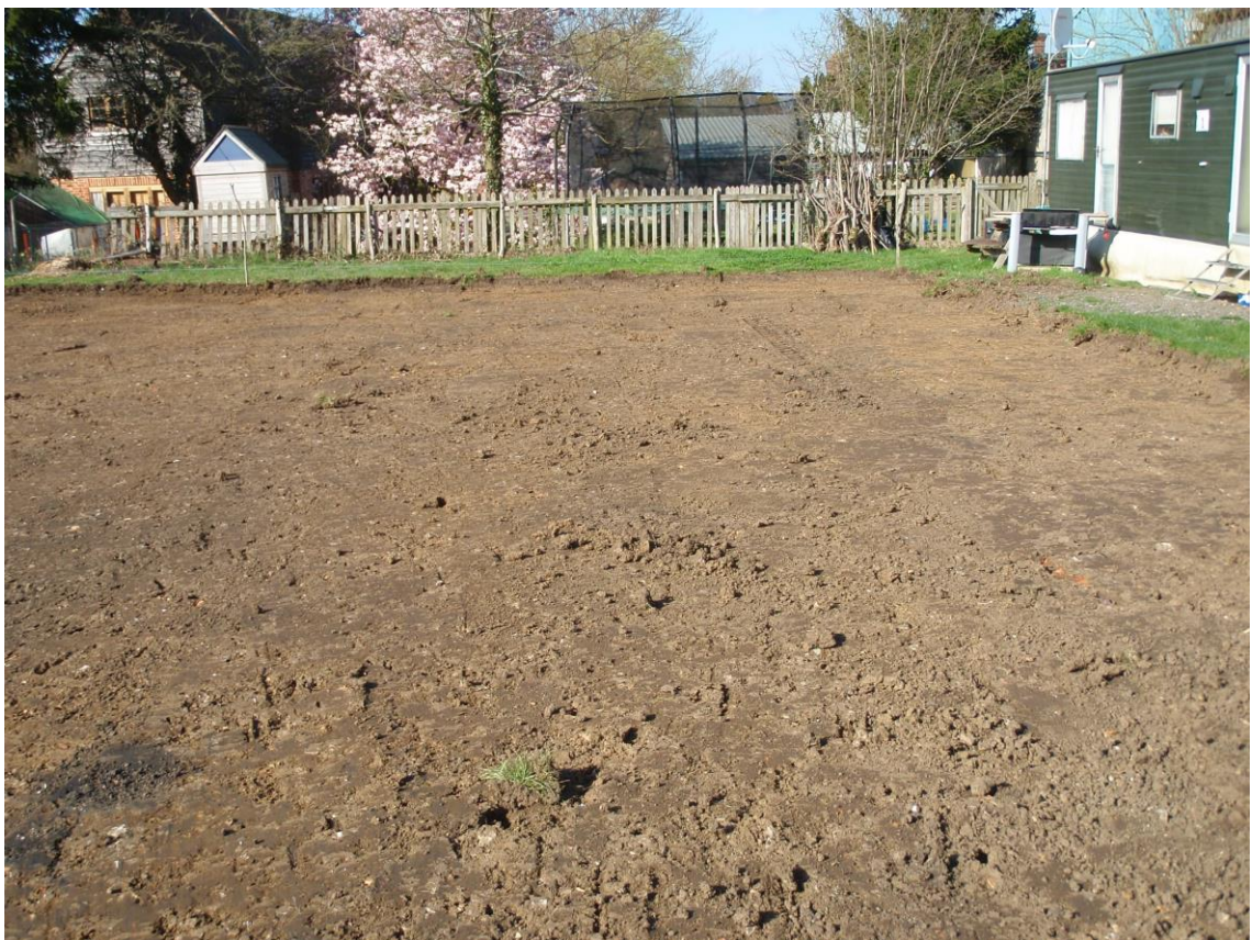
Plate 3. View of site (looking NE)