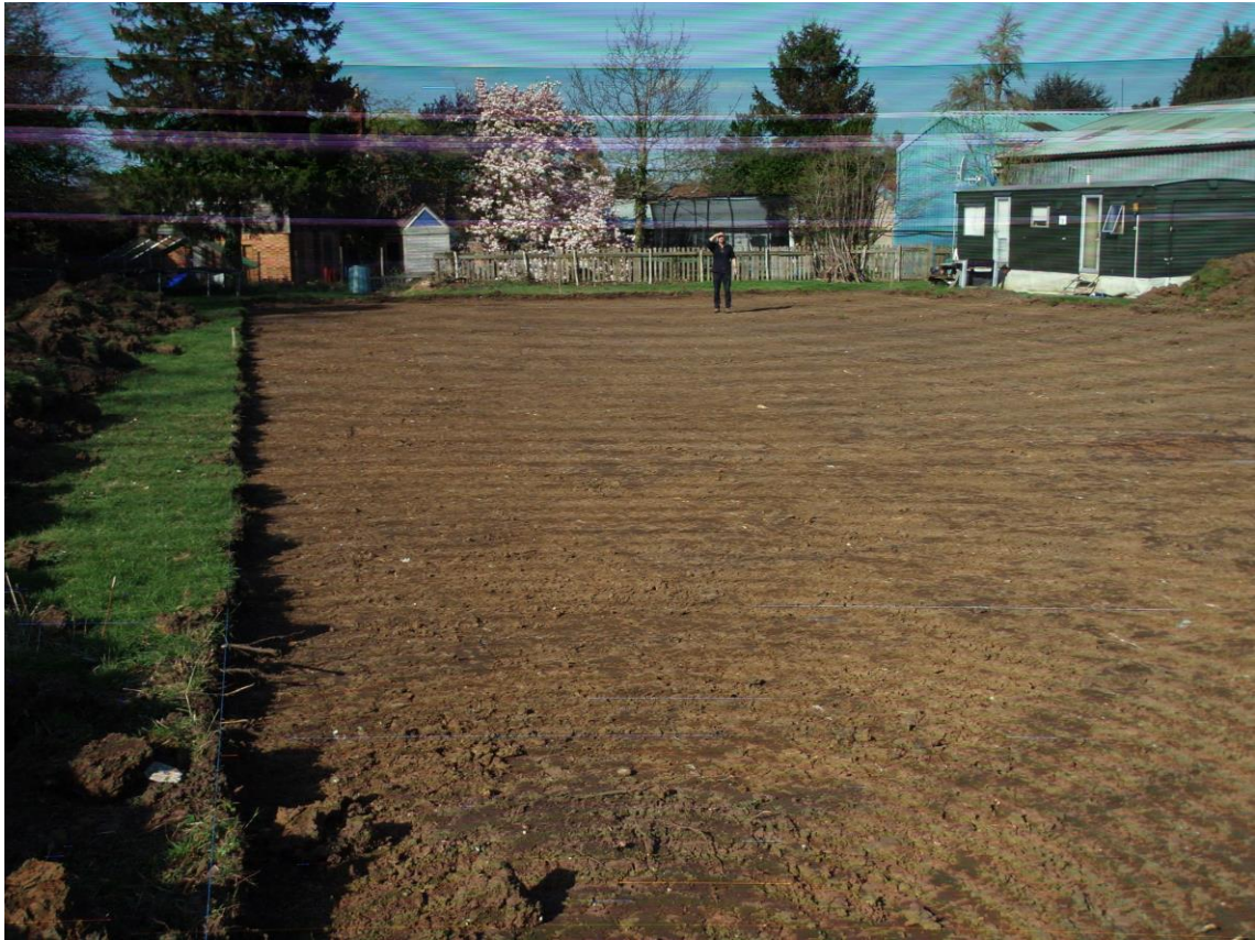
Plate 2. View of site (looking north)