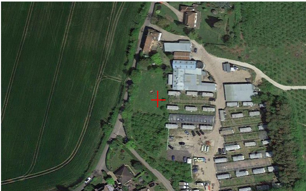
AP 1. Aerial view of site (red target) showing the site during development.