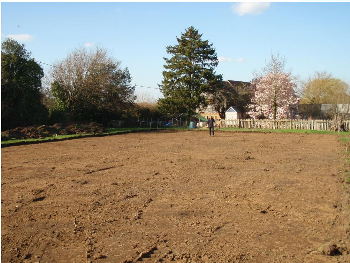
Plate 1. View of site (looking NNW)