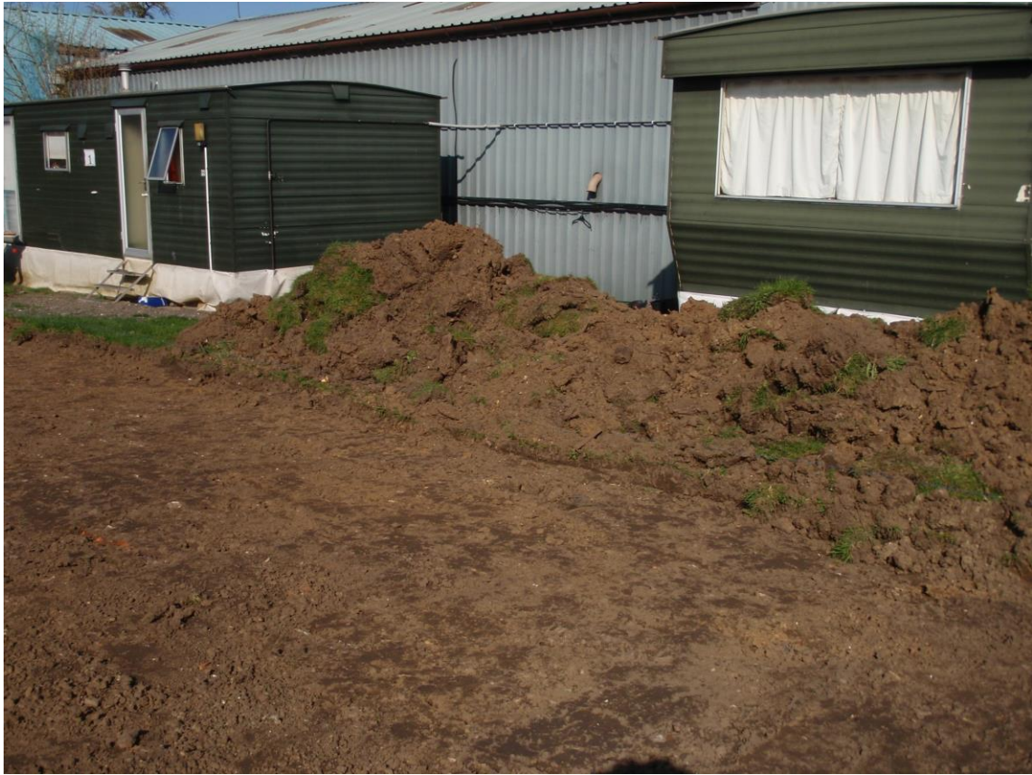
Plate 4. View of site (looking east)