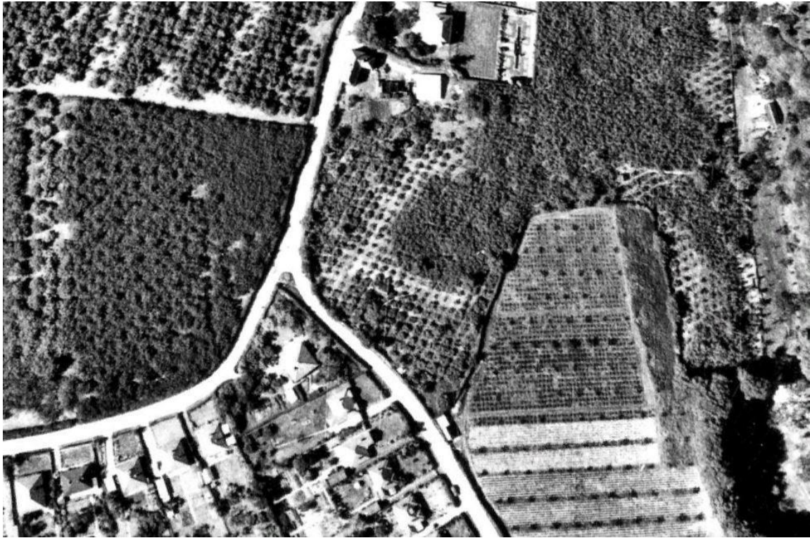
AP 2. Aerial photograph c.1960